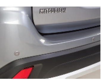
Rear parking sensors