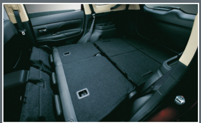
Split, fold, recline and a one-touch fold-to-flat mechanism on the third-row seats provides easy flexibility for transporting parcels and people.