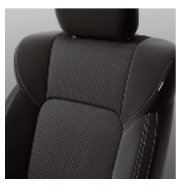
BLACK FABRIC (DESIGN)