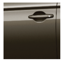
GRANITE BROWN (M)