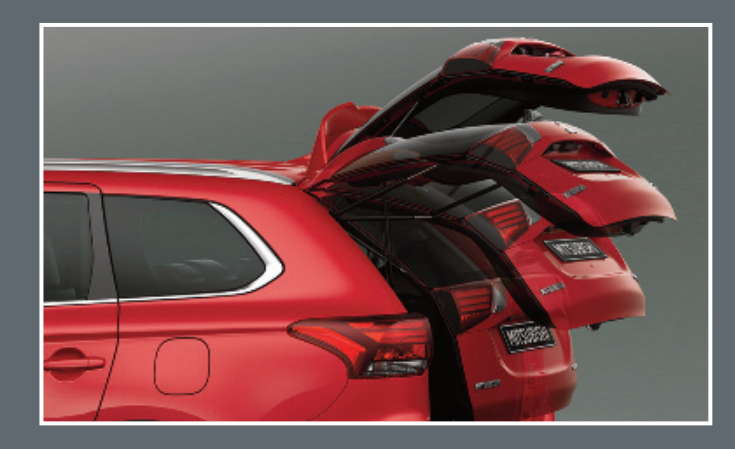
With the third row of seats folded down a huge boot with flat access allows you to carry loads of kit or your four-legged friends, and access is even easier with a power tailgate. (Exceed)