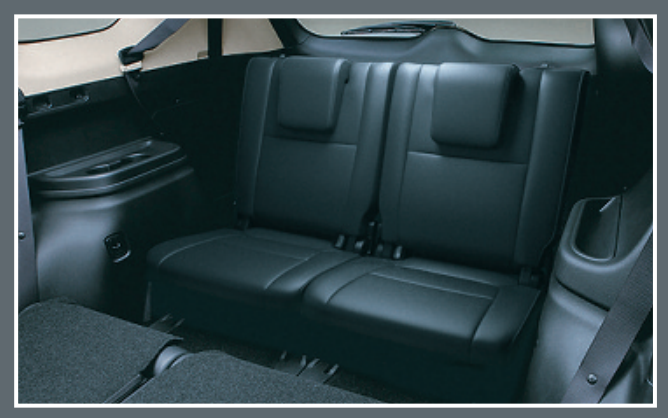
On the third row, properly sprung and padded seating, leather on the Exceed, is standard equipment.