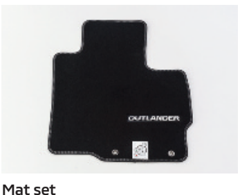
Front parking sensors