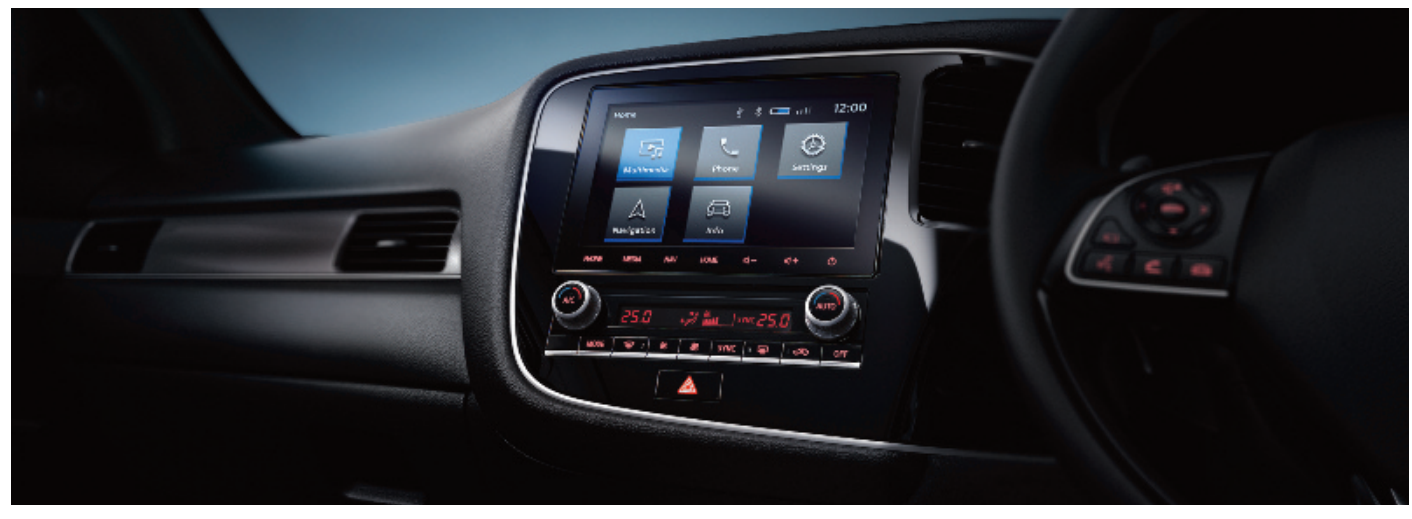
8" Smartphone link display will also support movie playback.