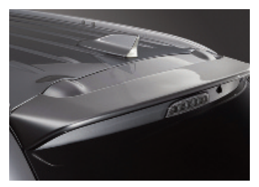
Large Rear Spoiler