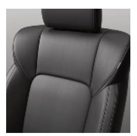
BLACK LEATHER (EXCEED)

Available M: Metallic* P: Pearlescent* D: Diamond* S: Solid *Metallic, Pearlescent and Diamond paint finish available at additional cost. Colours and trims reproduced on these pages may vary from the actual colours due to the limitations of the printing process used.